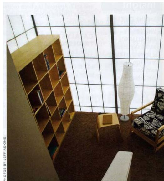
A stairway reading area is part of the architectural styling of The Townhomes at Spicer Village in Akron's University Park.

The first phase of Spicer Village, a 25-unit townhome