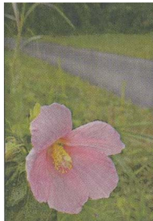
A flower grows along a new section of the Towpath Trail.